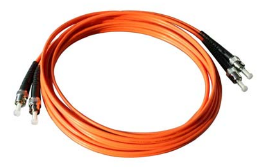
Figure 1. Multimode Duplex ST-ST Patch Cable