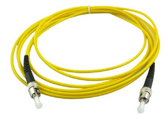
Figure 2. Singlemode ST-ST Simplex Patch Cable