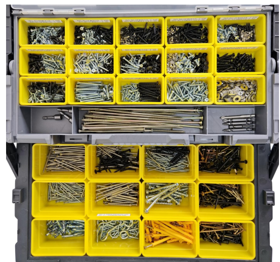
Figure 6. Multi-functional and Retrievable