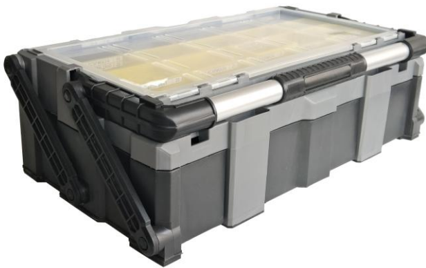
Figure 2. Back View