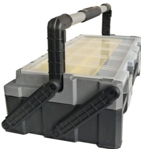
Figure 3. Side View