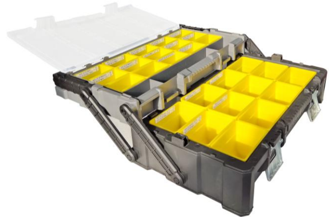
Figure 4. A Trapezoidal Tiered Design