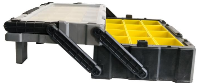
Figure 5. Cantilever Latch Design