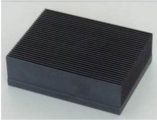
Figure 1. The Physical Photo of ATHS-2/120/90/35A