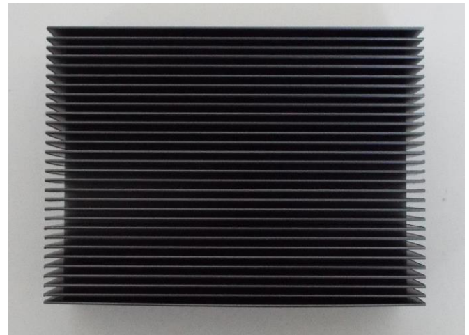
Figure 2. The Top View of ATHS-2/120/90/35A

As everyone knows, all semiconductor devices have some electrical resistance. This means that when power diodes or a power transistor is switching or otherwise controlling reasonable currents, they dissipate power as heat energy. High temperature makes the device work unstable, thus shortening the working life of the device. If the device is not damaged by this, the heat must be removed from inside the device at a fast enough rate to prevent excessive temperature rise. The most common way to do this is by using a heat sink.