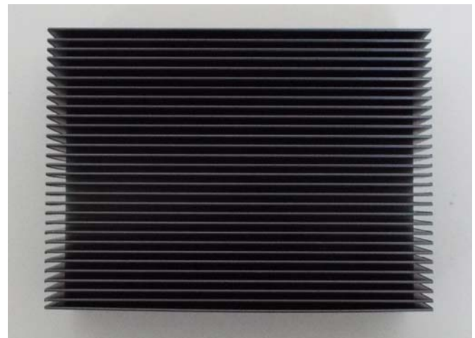
Figure 2. The Top View of AHS-2/120/90/35A

As everyone knows, all semiconductor devices have some electrical resistance. This means that when power diodes or power transistor is switching or otherwise controlling reasonable currents, they dissipate power as heat energy. High temperature makes the devices work unstably, thus shortens working life of the devices. If the device is not to be damaged by this, the heat must be removed from inside the device at a fast enough rate to prevent excessive temperature rise. The most common way to do this is by using a heat sink.