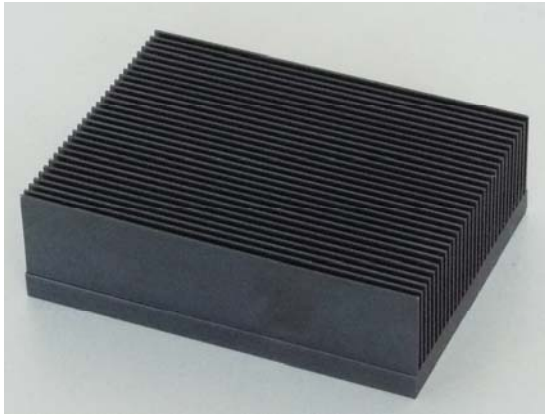
Figure 1. The Physical Photo of AHS-2/120/90/35A