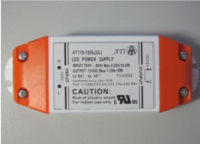
Figure 1. The Physical Photo of ATI15-12VL