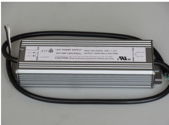
Figure 2. The Physical Photo of ATI100-12VLP