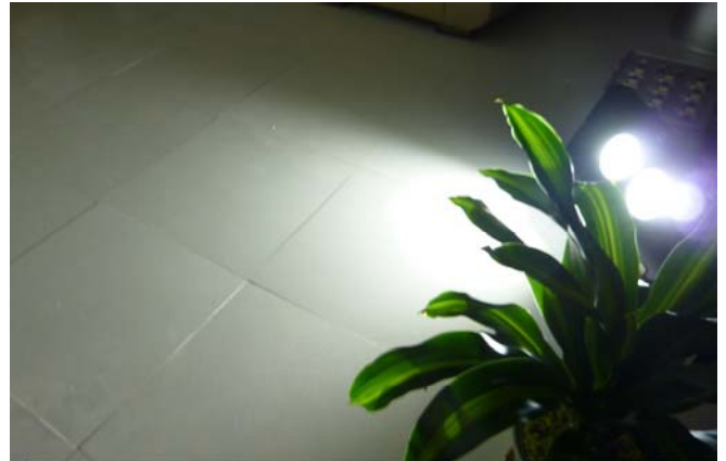
Figure 5. Lighting Effect

Outdoor applications where resistances to water, corrosion, shock, dust are required and strong natural lighting is needed, such as marine lighting, tunnel lighting and other outdoor applications, etc.