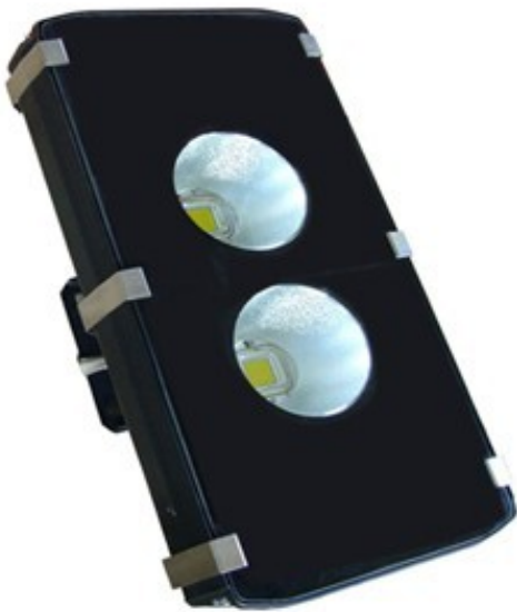
Figure 1. The 60° Light