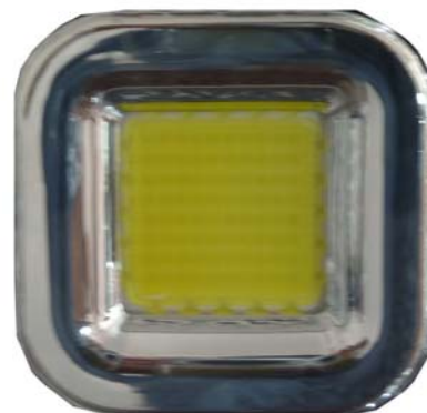
Figure 4. Integrated LED Light Source