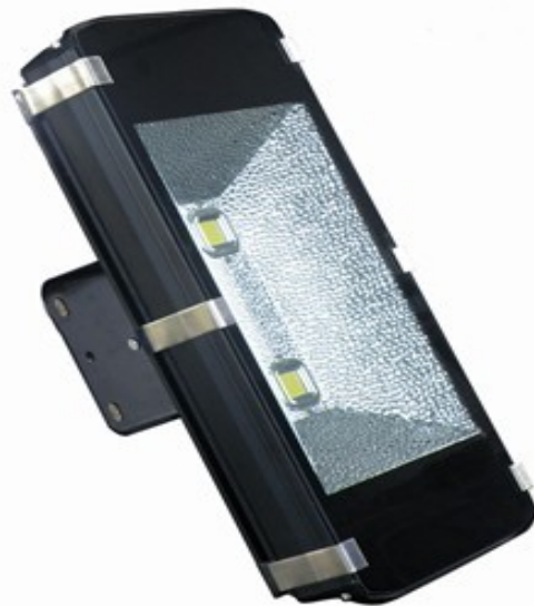
Figure 2. The 120° Light