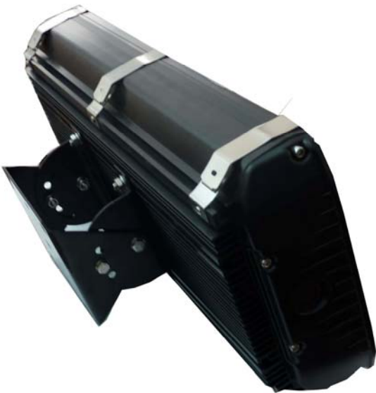
Figure 3. Back View of the Light