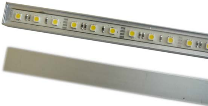
Figure 3. Actual Photo of Normal ATLS5050