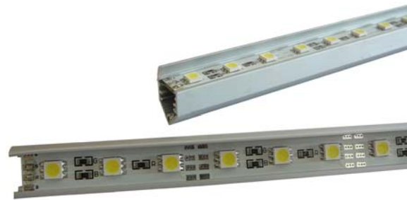
Figure 4. Actual Photo of Shap-ended ATLS5050