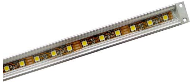
Figure 2. Actual Photo of Waterproof ATLS5050