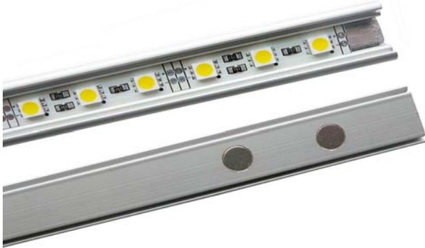
Figure 1. Actual of Photo Magnets- mounted ATLS5050