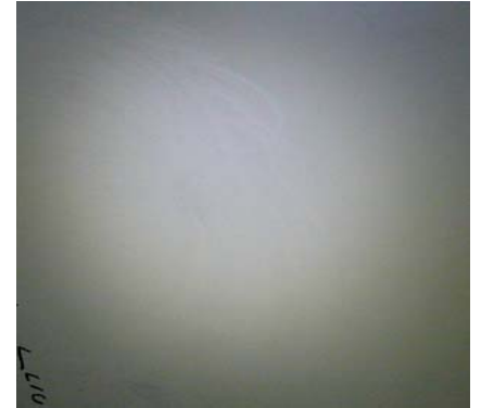
Small lantern head 12 feet