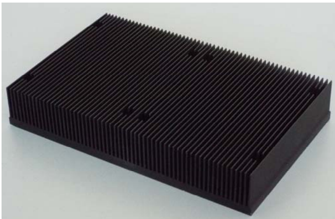
Figure 2. The Physical Photo of ATHS-4/240/150/40H8