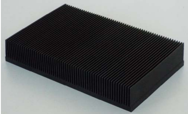
Figure 1. The Physical Photo of ATHS-4/240/150/40A