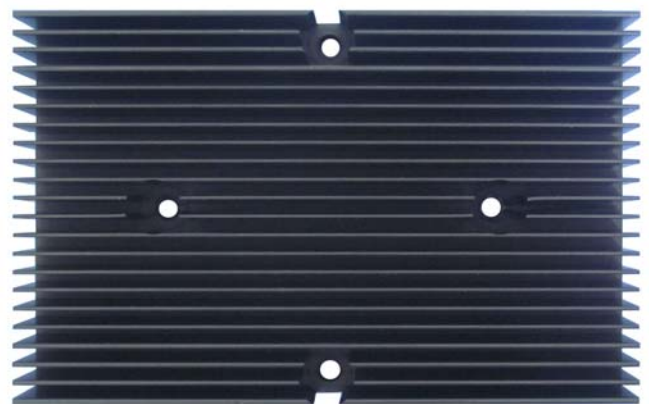
Figure 2. The Top View of Heat Sink

As everyone knows, all semiconductor devices have some electrical resistance. This means that when power diodes or power transistor is switching or otherwise controlling reasonable currents, they dissipate power as heat energy. High temperature makes the devices work unstably, thus shortens working life of the devices. If the device is not to be damaged by this, the heat must be removed from inside the device at a fast enough rate to prevent excessive temperature rise. The most common way to do this is by using a heat sink.