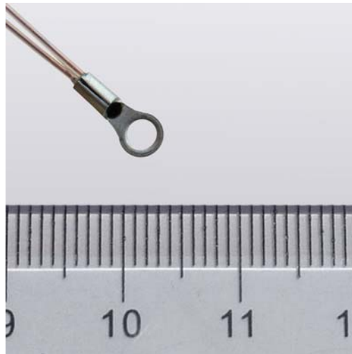
Figure 1.2. The physical photo of ATH10KBL2AT65S