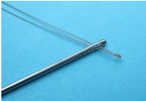
Figure 1 The physical photo of ATH10K1R0