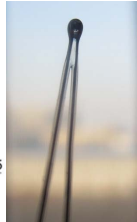
Figure 2. Side View of ATH10K1R0