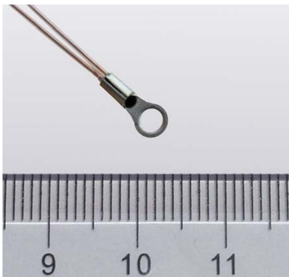
Figure 1.2. The physical photo of ATH100KL2AT63S