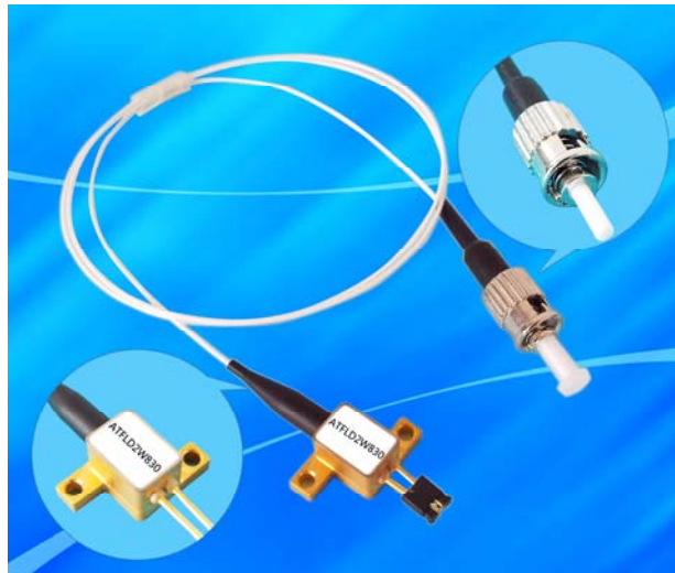
Figure 1. Physical Photo of ATFLD2W830