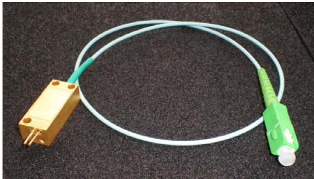
Figure 1. Physical Photo of ATFLD1W830