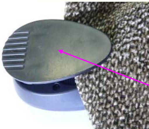
Back side as complete in the carton