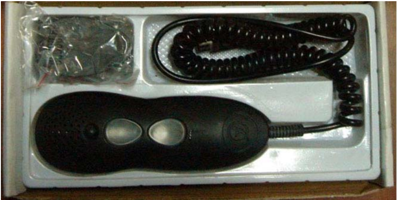
Voice Controller in the Package